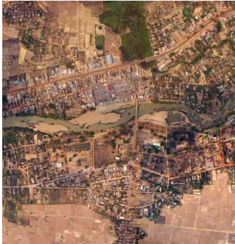
Photo 9: After georeferencing, mosaicing and post processing, all photos will be merged to a large, high resolution orthophoto*

Finally the Department of Land Management produced a map based on the aerial photo, in order to discuss plans for the future development of the town.