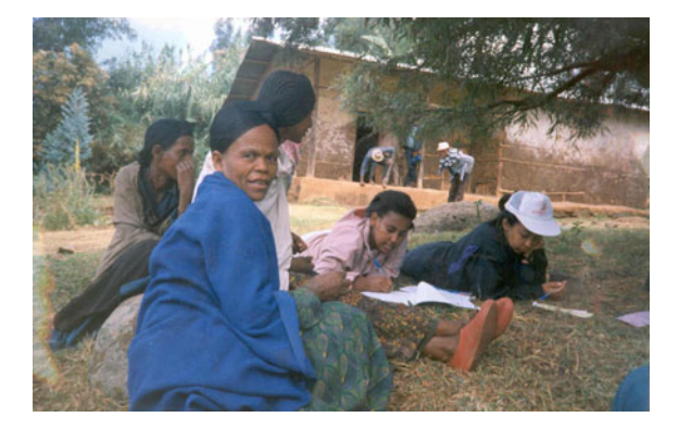
Photo 1: Gender mainstreaming often implies empowerment and training of women

The project setup also incorporates the principles of gender mainstreaming. Staff acquisition procedures have been adopted to promote a gender balance of male and female staff members. When this was not possible, it was compensated by female consultants and interns. Female and male project staff as well as counterpart staff have been trained on the integration of gender issues into all activities. Participatory Land Use Planning (PLUP) and Participatory Rural Appraisal (PRA) activities were carried out actively involving the male and female population. The frame conditions (e.g. time and location of activities, flow of information within the community) have been considered in order to avoid disadvantages for the male or female target groups. In a number of surveys, men and women have been interviewed separately, where gender disaggregated information was desired. Generally, gender disaggregated data was used to analyse the existing situation in the districts and communities.